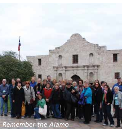
Remember the Alamo